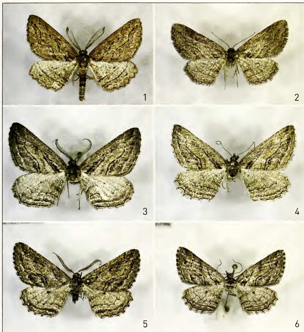
Figs 1–6. Adults of Menophra and Sardocyrnia species. 1. Menophra annegreteae sp. n., holotype, ♂, Spain. 2. Menophra annegreteae sp. n., paratype, ♀, Spain. 3. Sardocyrnia fortunaria , ♂, Spain. 4. Sardocyrnia fortunaria , ♀, Spain. 5. Sardocyrnia bastelicaria , ♂, Corsica. 6. Sardocyrnia bastelicaria , ♀, Corsica.

Female genitalia (Fig. 13). Ovipositor lobes rounded, slightly sclerotised, densely covered with setae; another patch of setae present on mid-ventral area in front of ovipositor lobes. Segment A8 dorsally sclerotised, ventrally largely membranous. Postvaginal area transversely wrinkled. Lamella antevaginalis slightly sclerotised, shortest in middle, with longitudinal (laterally curved: longitudinal/transverse) wrinkles. Ductus bursae moderately sclerotised, sub-cylindrical, almost as long as apophyses anteriores. Corpus bursae ovoid, membranous, with very weakly sclerotised signum. Ductus seminalis arising close to ductus bursae ventrally (n=2).